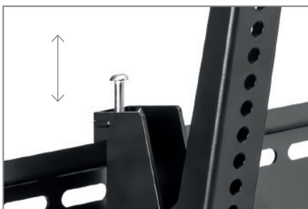
incl. height compensation up to 10 mm