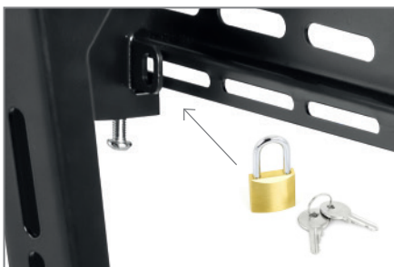
incl. optionally usable lock

The bracket can be secured against theft with the supplied padlock.